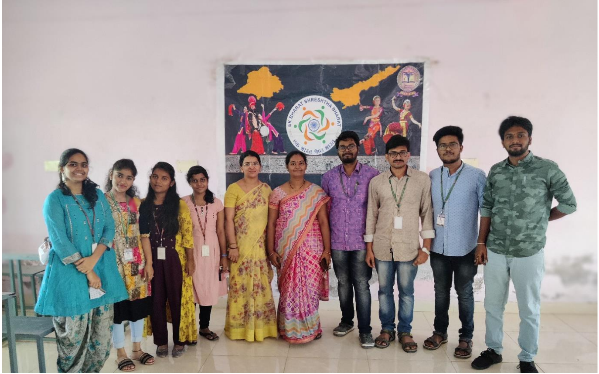
EBSB Club members